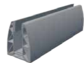
5m, 6m rods

oval end taps without notch in natural anodization, stainless steel 304 and RAL colours